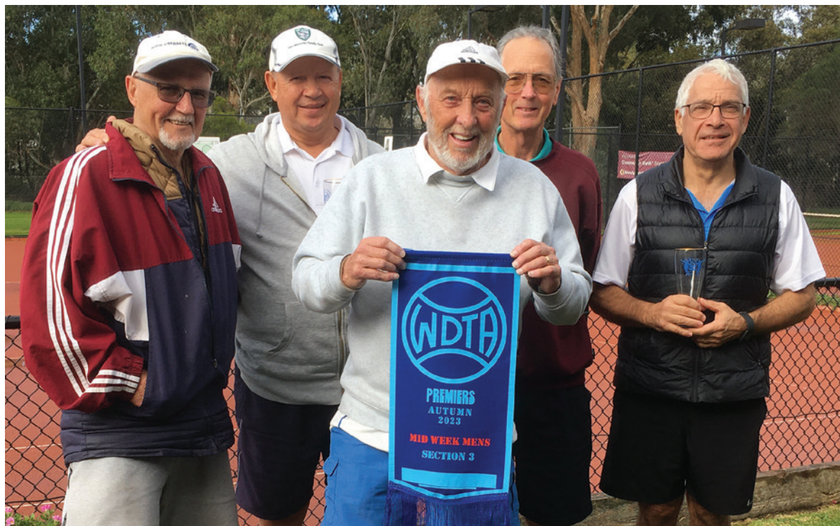
Mid-Week Men's Section 3 Champions